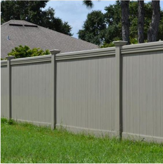
Maxwell Vinyl Fence

48", 60" or 72" high Black Avalon 3-Rail Fence