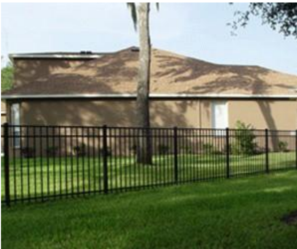
Avalon 3 Rail Black Powder Coated Aluminum